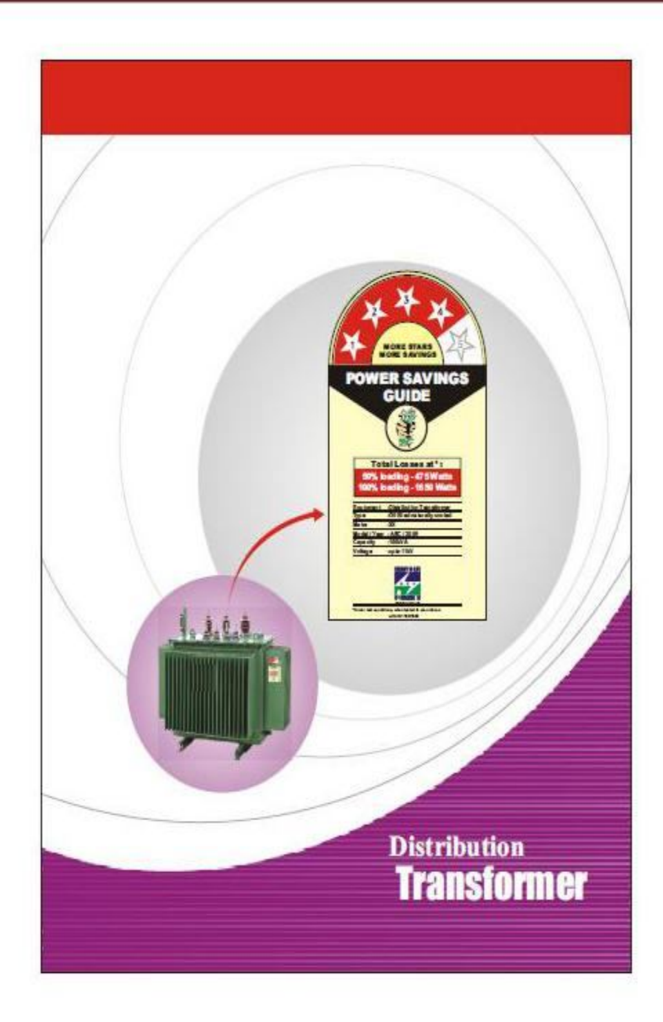
Fig. 3. Colour Scheme: Sample Picture of manner of affixing of Label: